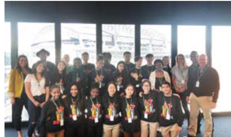
Students & Participants at the 2018 NEXUS Program introducing high school students to CRE.

LEARN MORE ABOUT DIVERSITY & INCLUSION SPONSORSHIP OPTIONS & BENEFITS